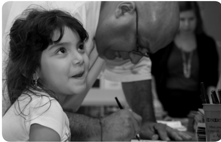
Excitement for Family Literacy Night builds at Clemente Elementary School. Studies show a parent's literacy drives their child's success.